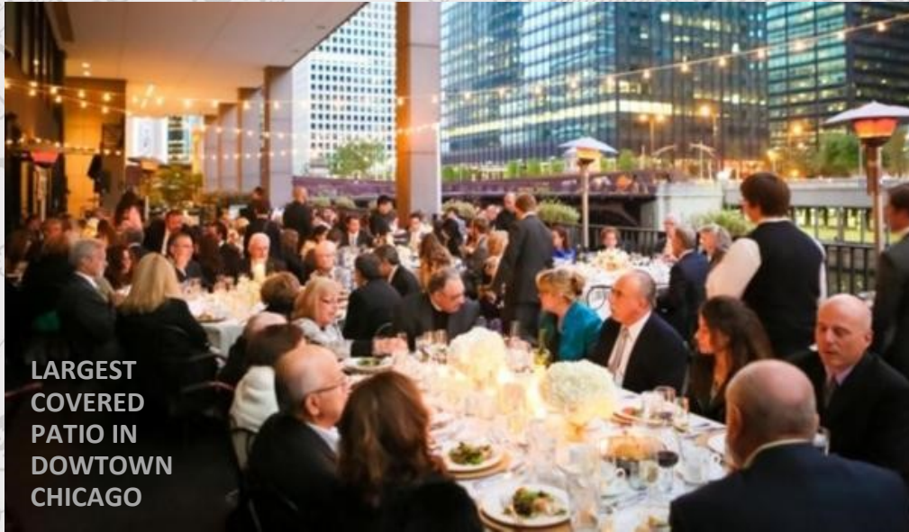
LARGEST COVERED PATIO IN DOWNTOWN CHICAGO

Tucked along the banks of the Chicago River, Rivers Restaurant is a spectacular place to wed, dine, and celebrate with all of your family and friends. Perfectly positioned within the financial district of Chicago, this downtown venue presents an urban wedding and reception setting for brides and grooms seeking a lively city space without the usual urban noise.